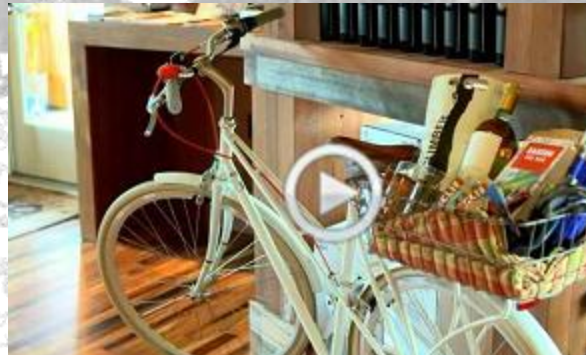
Clif Family Winery