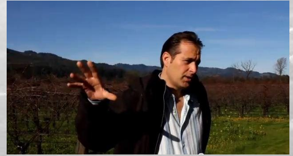
Grgich Hills Estate Winery