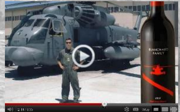
Blanchard Family Wines