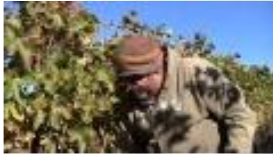
Kamen Estate Wines