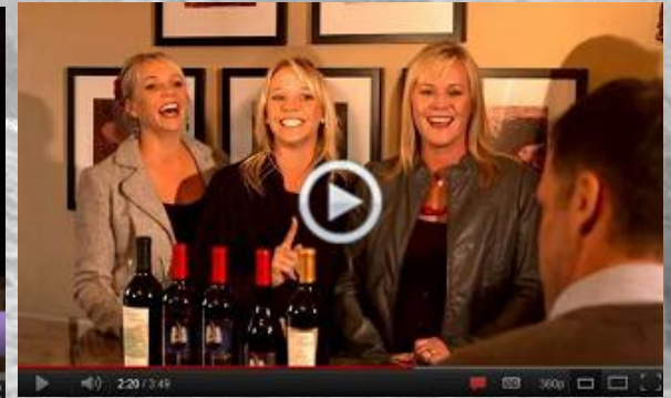
Robinson Family Vineyards