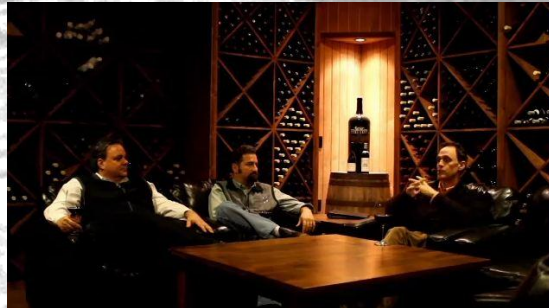
The Corley Family